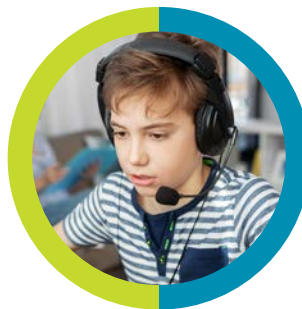
MIDDLE SCHOOL 2-3 HOURS