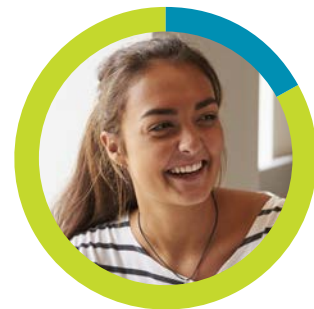
HIGH SCHOOL 1/2 - 1 HOUR